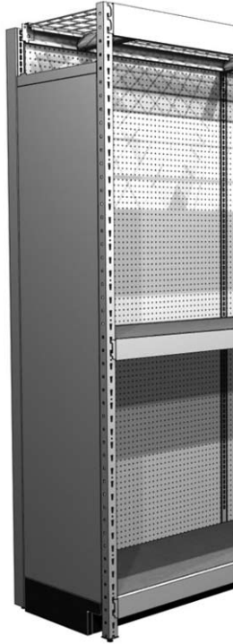
Heavy Duty Beam